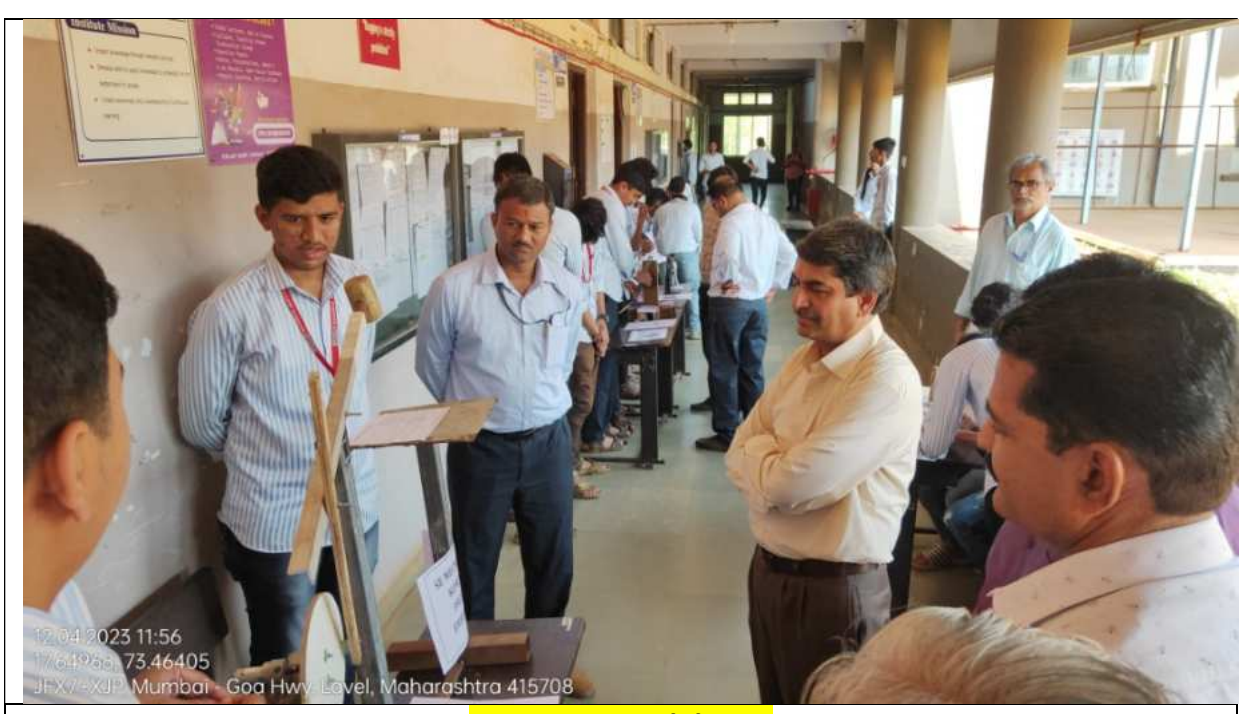
Mini Project Exhibition

Guest Lecture hosted by Indo German Tools on February 20, 2023. This event proved to be a remarkable opportunity for our community to gain valuable insights into cutting-edge tools and technologies shaping the industry today.