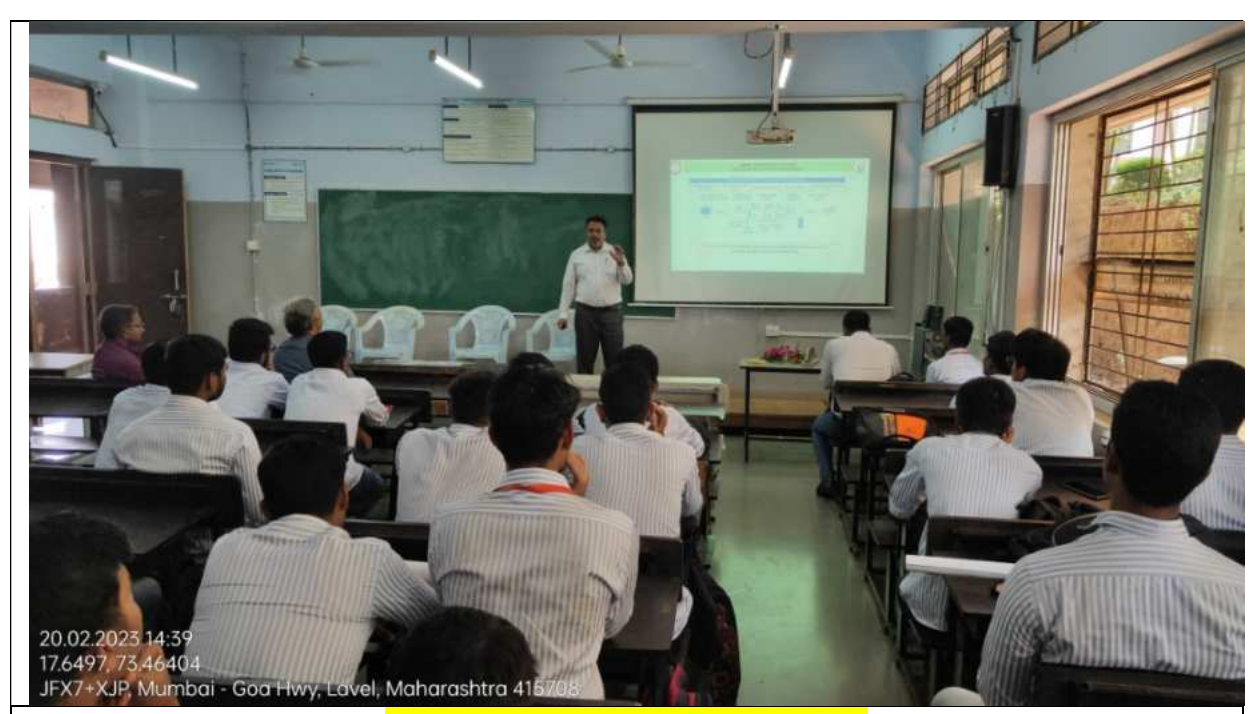
Guest Lecture by Indo German Tools

Guest Lecture hosted by Indo German Tools on February 20, 2023. This event proved to be a remarkable opportunity for our community to gain valuable insights into cutting-edge tools and technologies shaping the industry today.